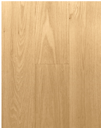
HALO 6" SAL602 | 8" SAL802