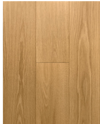
LUCID 6" SAL603 | 8" SAL803