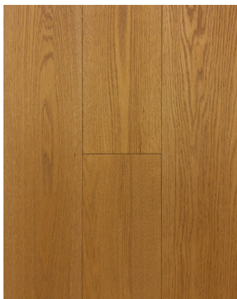
SEPIA 6" SAL605 | 8" SAL805