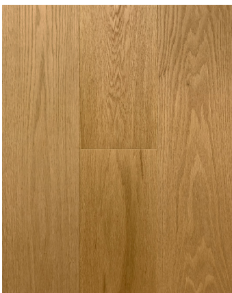
INTRIGUE 6" SAL604 | 8" SAL804