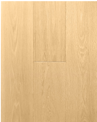
ARIA 6" SAL601 | 8" SAL801